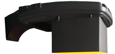
Shown with ARM mount and Baffle