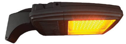
Shown with ARM mount