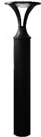
BRLD-Q Decorative Round LED Bollard