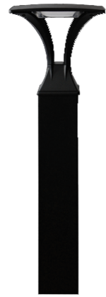
BSLD-Q Decorative Square LED Bollard