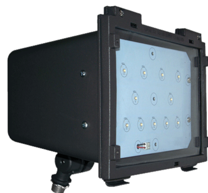
FL2-Q Small LED Flood Light