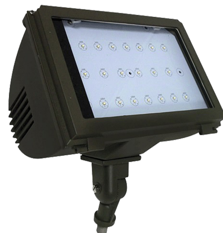
FL8-Q Round Back LED Flood Light