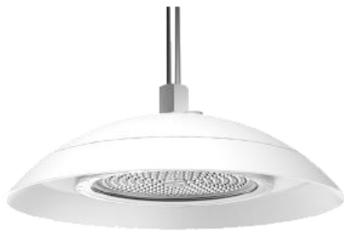
3/4" NPT Adapter (conduit not included)