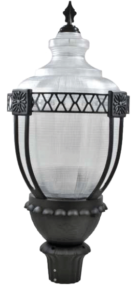
PT18-DM LED Post Top