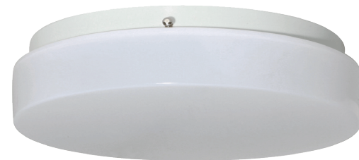
SD25-G LED Surface Disk